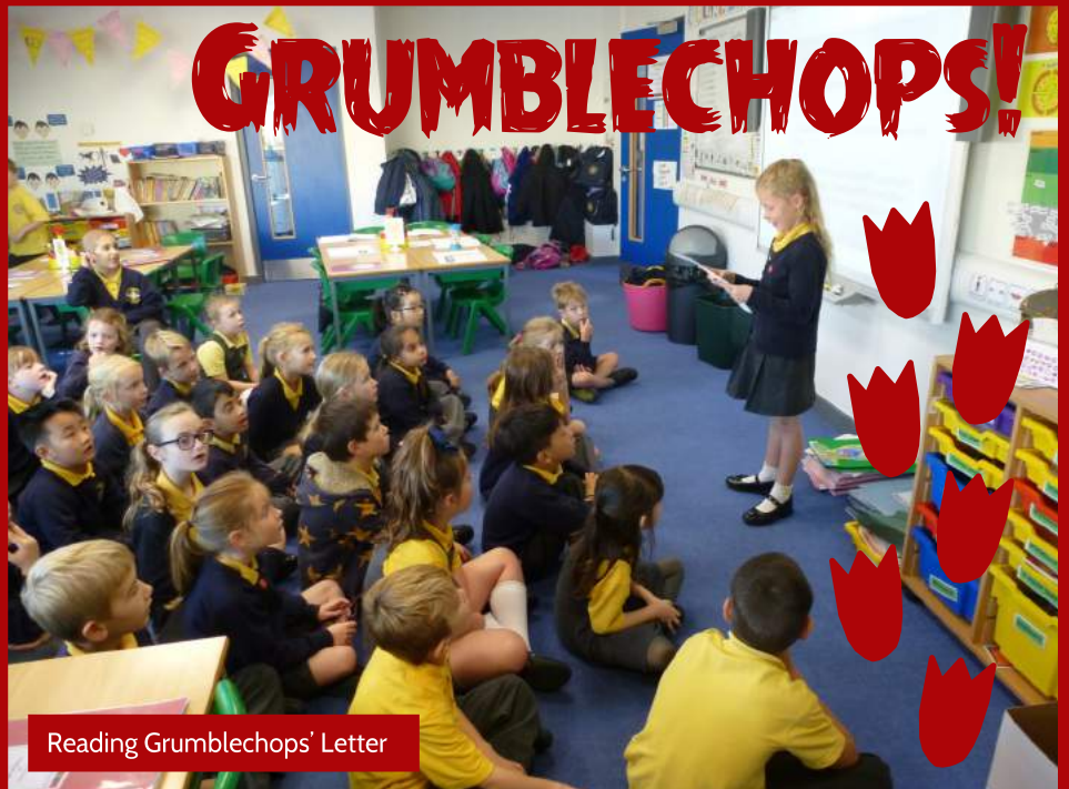
Reading Grumblechops' Letter

On Monday, the monster sneaked into our classroom at night and, as he sneaked in, he tripped over some flour as he was going to escape. We found chairs on the floor, a juice box and we saw some books on the floor. It was terrifying! The next day, the office gave us a letter and the letter said that the monster had no teeth! We found a present in the book corner...it was a book about the monster, called Grumblechops. We had to write a letter to the monster.