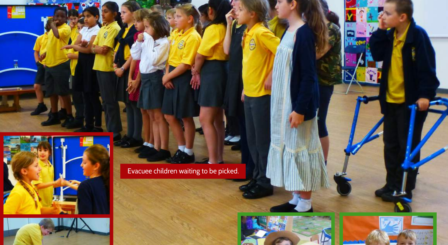
Evacuee children waiting to be picked.