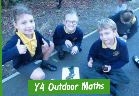
Y4 Outdoor Maths