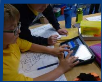
USING THE NEW IPADS