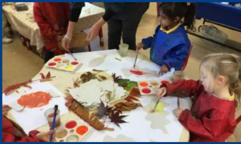
AUTUMNAL ART IN NURSERY